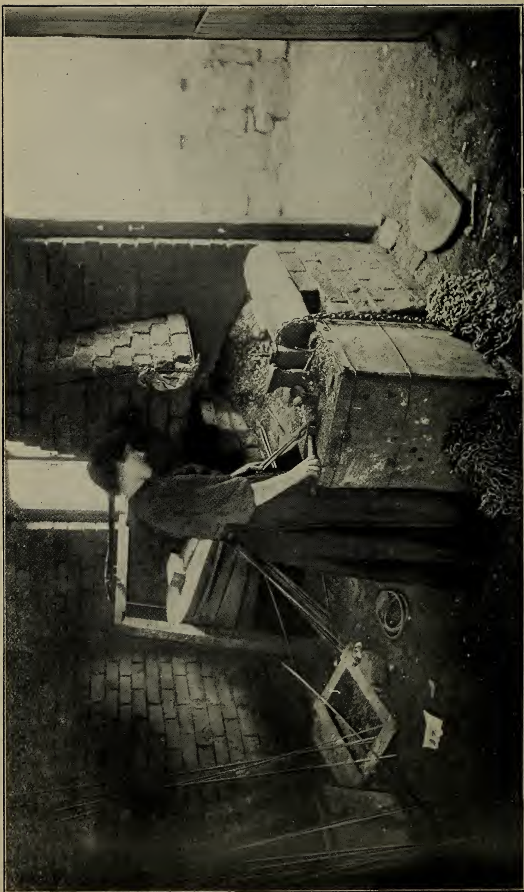
CRADLEY CHAIN MAKER.