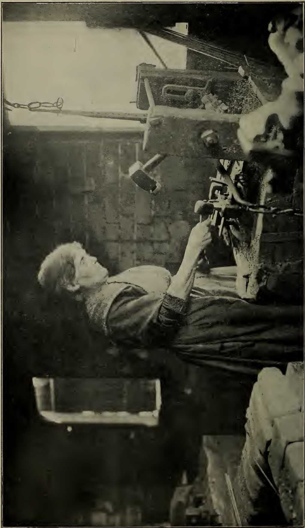
A BROMSGROVE NAIL MAKER.