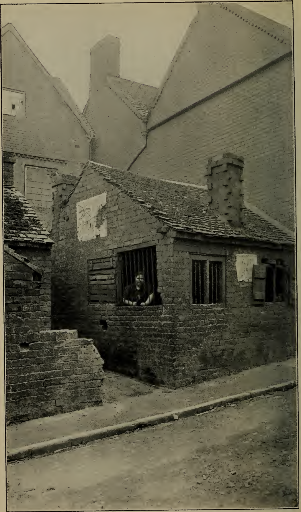
A CRADLEY CHAIN MAKER.