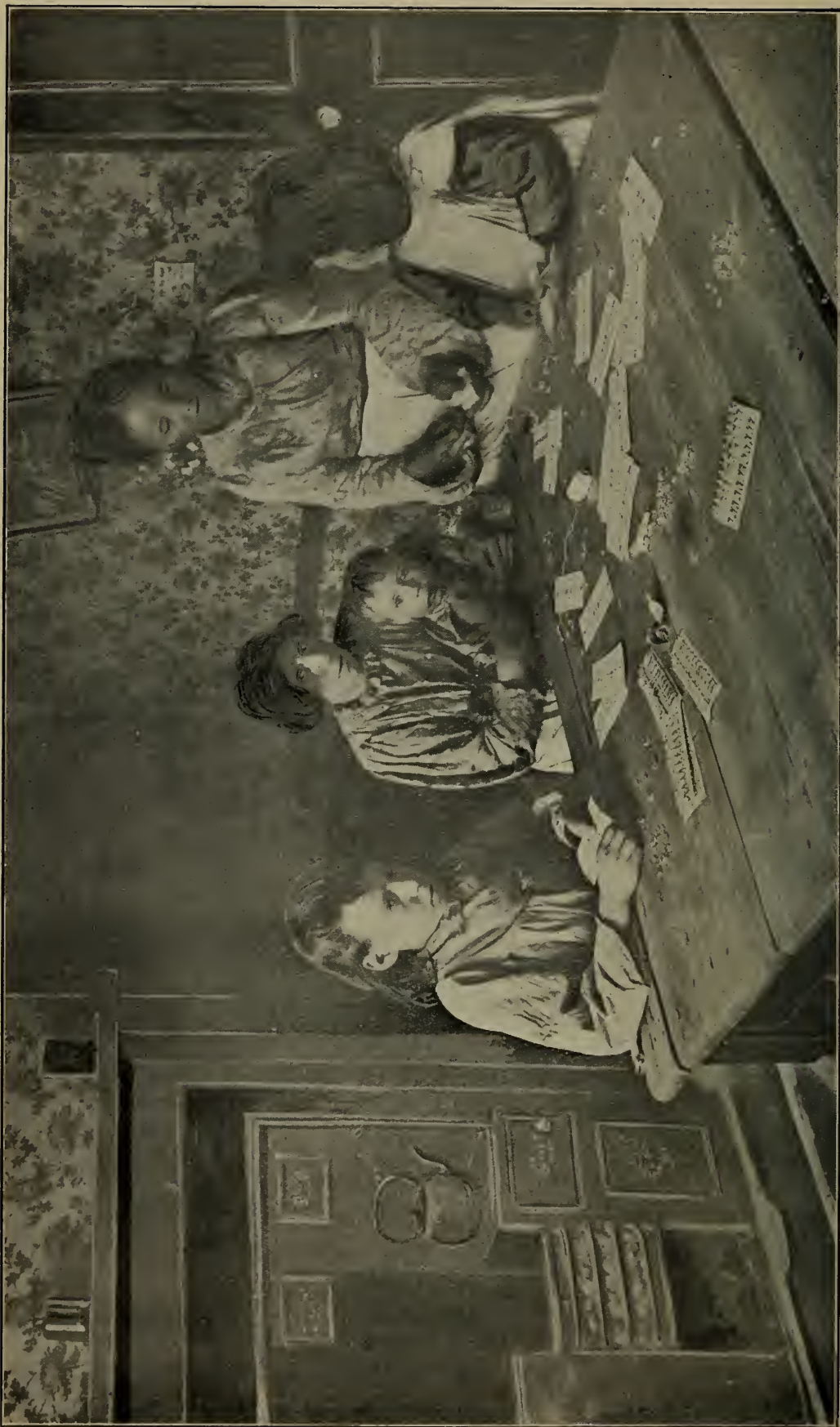
HOOK AND EYE CARDING.