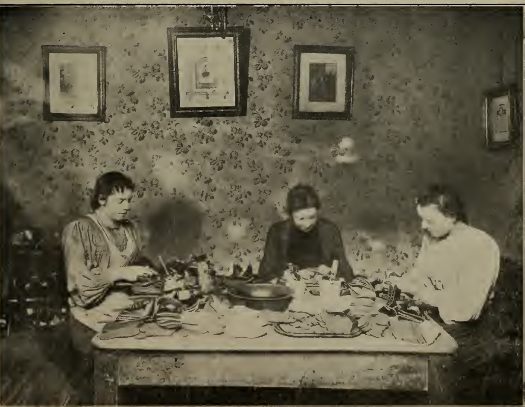
BABY'S BOOT AND SHOE MAKING