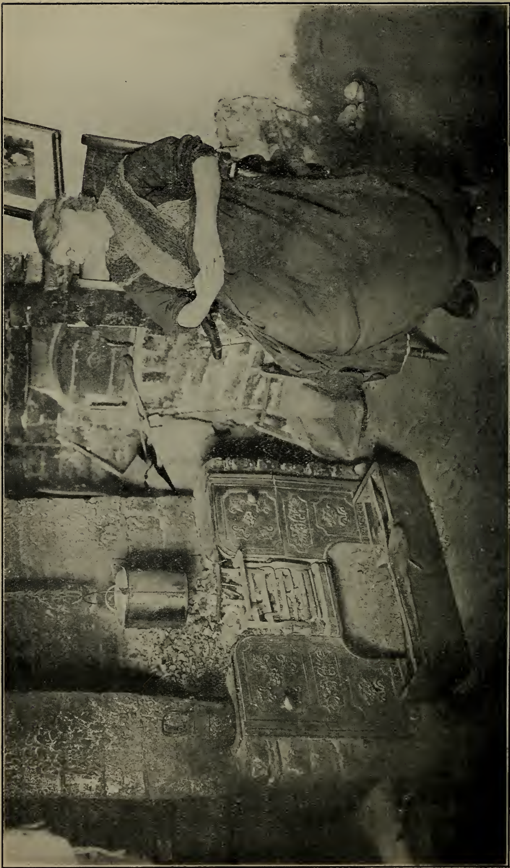
A BROMSGROVE NAIL MAKER AT HOME.