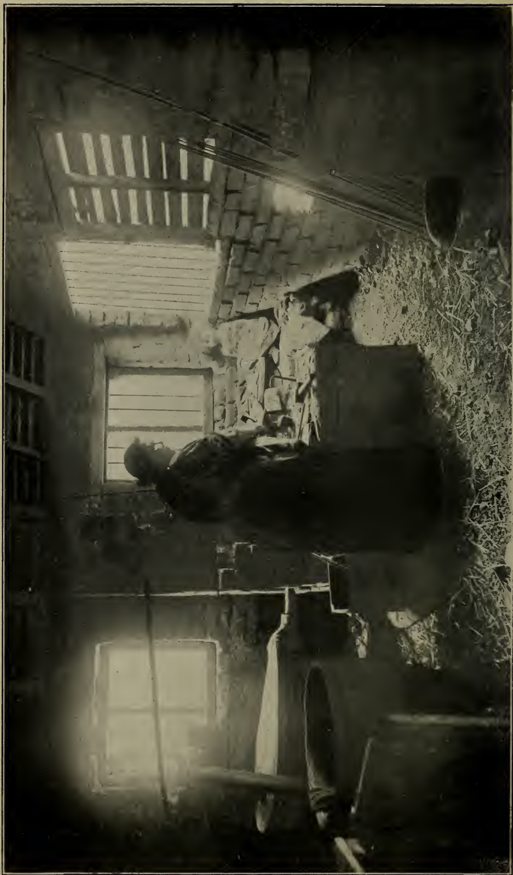
A CRADLEY CHAIN MAKER.