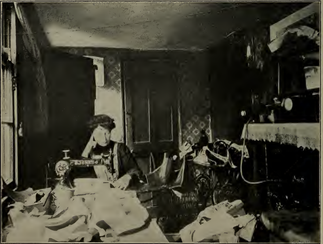
BOOT UPPER MAKING.

The present Government, however, has several times expressed its intention to carry out its professions as to being a model employer in actual practice as well as on paper, and the Minister of War has expressed himself as sympathetic on this matter. He has promised to put in force some system of inspection by which fair wages shall be secured for those employed by contractors on military embroidery. He has also expressed in a practical way his desire to put down sweating, by aiding us to show it up at this Exhibition, and has most kindly supplied from the Pimlico Army Clothing Factory the material upon which our military embroideress will work at the Hall. For this the Committee have to tender him their most sincere thanks.