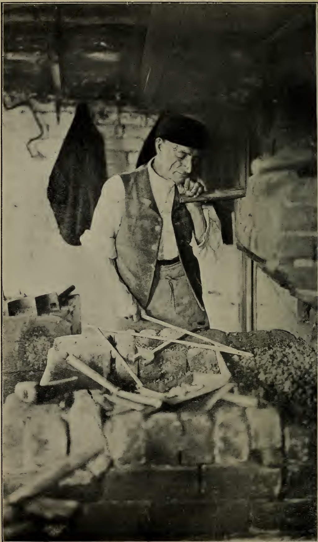
A BROMSGROVE NAIL MAKER.