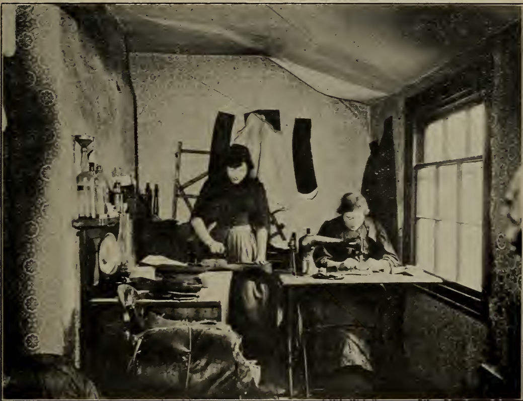
MEN'S COAT MAKERS.

there, is not the slop and shoddy for the poorer classes who cannot afford to pay, but are for the use of the well-to-do classes, who can, and do, pay well for them. To those an appeal has been made from time to time, by the tailors' and tailoresses' society, imploring of them to insist upon seeing the places wherein their clothing is being made, with little or no result. Perhaps it is well for their ease of mind that they don't do so, if they did they would, in some instances, certainly never wear them unless they had previously been well fumigated and disinfected.