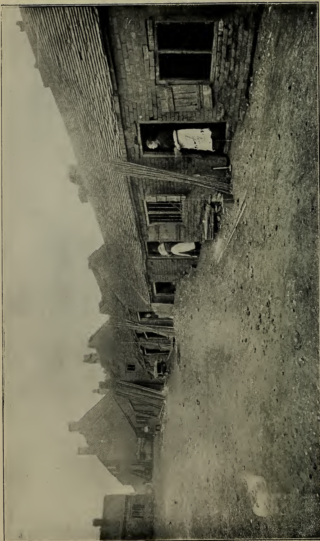
THE CHAIN MAKERS' "WORKSHOPS."