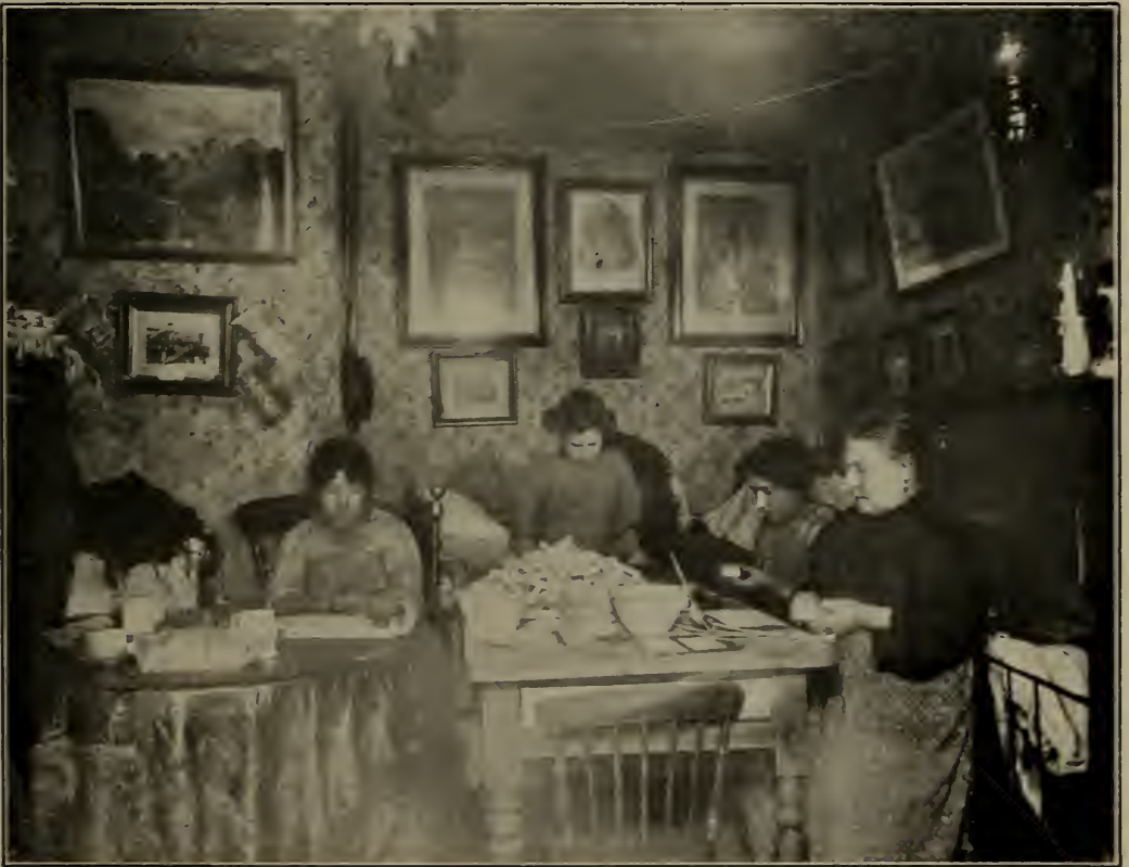
MATCH AND TIN-TACK BOX MAKING.

In the Daily News the writer published the names and addresses of the two firms concerned. The match firm was Messrs. Maguire, Miller and Co., of Liverpool. A correspondent wrote them directing their attention to the dreadful conditions under which their boxes were being made. Messrs. Maguire, Miller and Co. replied on November 25th, 1905, saying that: "We have had our boxes made by a London firm, but were always under the impression that they were made mostly on the premises and under proper conditions;