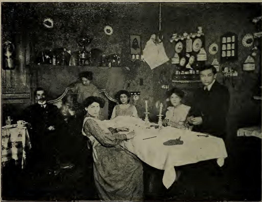
CIGARETTE CASE MAKERS.

There are two main divisions in the production of cigarettes, i.e. , the flat and the round cigarettes. The average rate of payment for flat is from 4/6 to 5/6 a thousand, and for round cigarettes 2/6 and exceptionally 3/- to 3/6 a thousand. Occasionally girls are paid 2/- a thousand for round cigarettes by the same firm who pay their men 2/6 for exactly the same work. It is obvious that workers in order to make a living wage must have outside help for making cigarette cases. As a firm seldom makes any provision for this work the cigarette maker must make his own arrangements for out-workers. This work is very often done by girls working in their