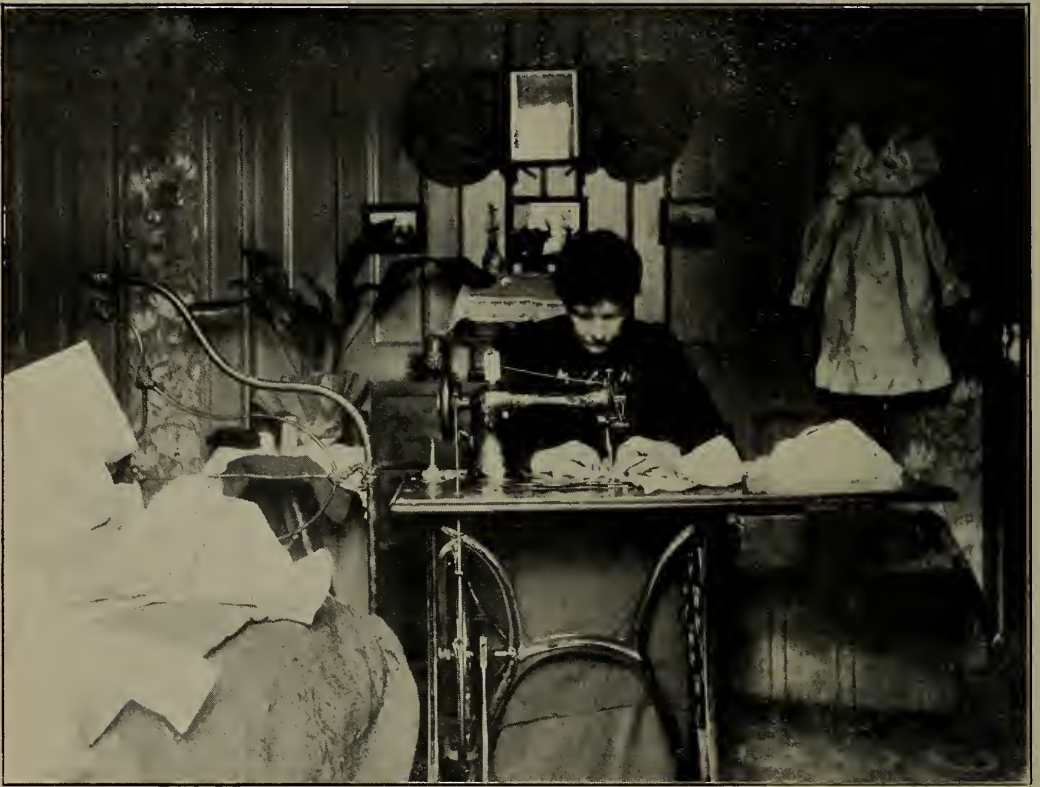
MAKING CHILDREN'S OVERALLS AND PINAFORES.

homes. This was fur-pulling, one of the chief industries of Southwark. Women pulled out the long, coarse hairs from the skins of rabbits. Many of the skins were uncleaned, and a horrible sickly smell invariably told where the fur pullers worked. The fluff from the skins, not only covered everything in the room, including the workers' clothes, but got into throat and lungs, so that the women suffered from chronic bronchial catarrh and asthma, and the rate of infant mortality was high.