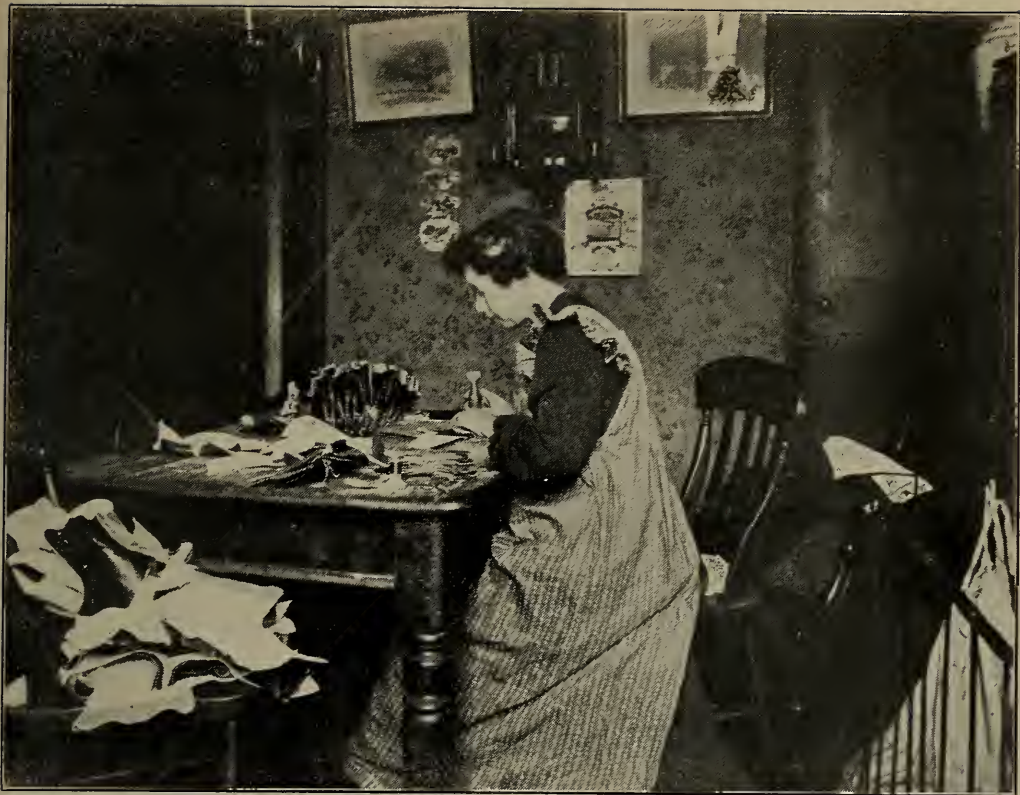
MAKING GIRLS' BUTTON BOOT UPPERS.