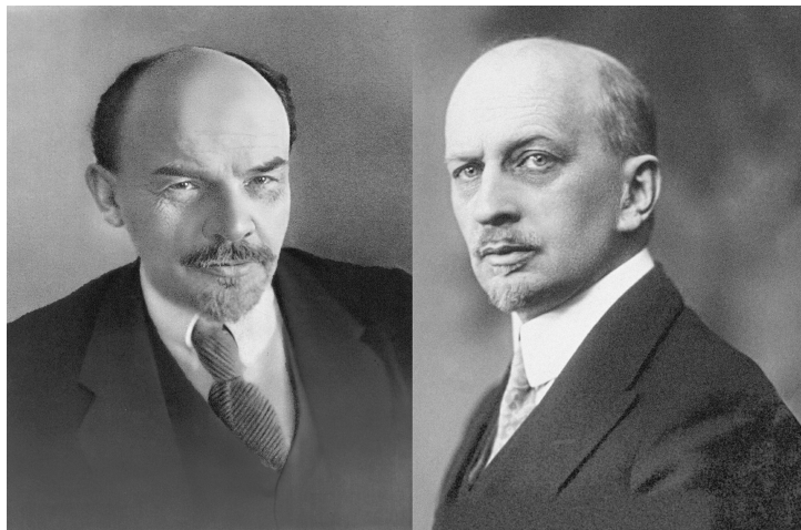
Lenin (left) and Ilyin (right)

Ilyin despised Lenin’s revolution, but he endorsed its violence and its voluntarism. Like Lenin, he thought that Russia needed a philosophical elite (himself) to define ends and means. Like the Marxist socialist utopia, Ilyin’s “divine totality” required violent revolution—or rather violent counterrevolution. Other Russian philosophers saw the resemblance. Nikolai Berdyaev found in Ilyin’s work “the nightmare of evil good.” Reviewing a book that Ilyin published in 1925, Berdyaev wrote that “a Cheka in the name of God is more horrifying than a Cheka in the name of the devil.” His judgment was prophetic: “The Bolsheviks would have no fundamental problem accepting Ivan Ilyin’s book. They consider themselves the bearers of absolute good and oppose those whom they regard as evil with force.”