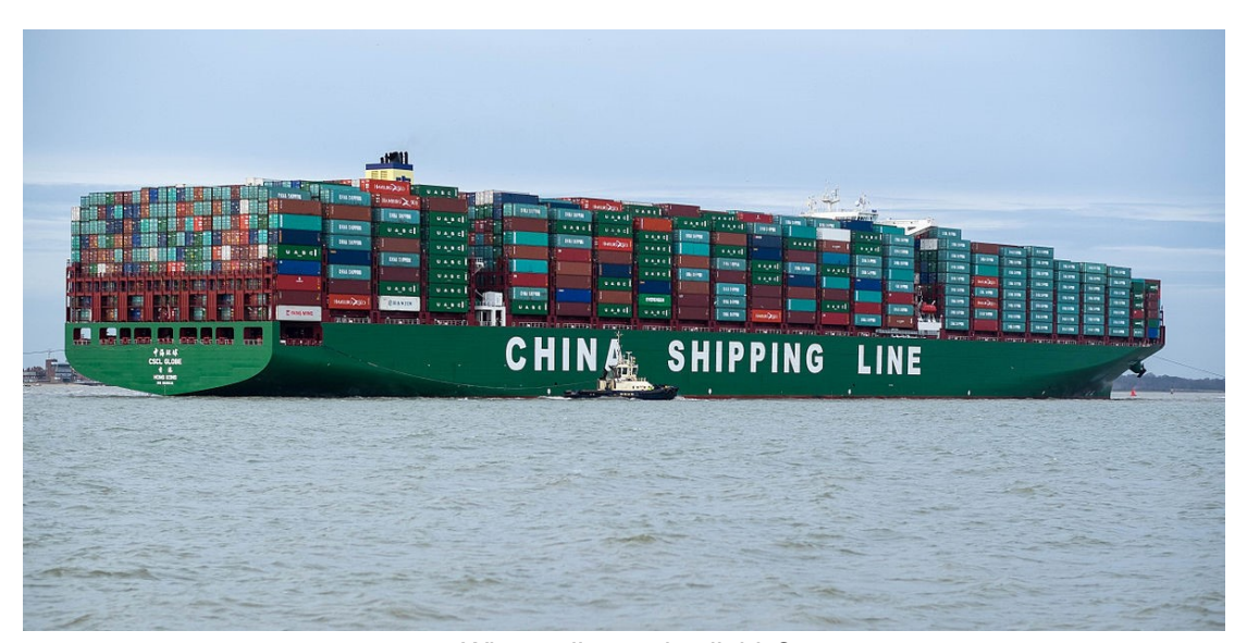
Who really needs all this?

Suppressing shipping emissions: Cruise ships are bad enough. But the bulk of shipping emissions today come from the thousands of container ships that course between China and the U.S. and Europe. Since China joined the WTO in 1991 the volume of world shipping has quadrupled<sup>46</sup> and the bulk of that is container ships full of mostly disposable products produced by police-state shackled, semi slave-labor in China's Special Exploitation Zones – all manner of plastic junk, disposable shoes, clothes, tools, and household goods, quickly obsolesced electronics and so on – products that in a rational sustainable economy would never be produced in the first place.<sup>47</sup>