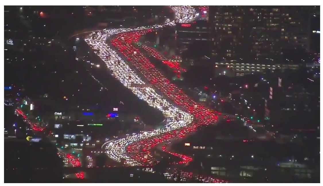
The San Diego Freeway ((Highway 405), Los Angeles

Environmentalists like Bill McKibben think the solution is simply to replace America's half-billion fossil fuel-powered cars with a half-billion solar and wind-powered electric cars.<sup>23</sup> There's a place for electric cars in a sustainable society but that's not the solution. Why? First, because the bulk of all the pollution produced over the life cycle of any vehicle, gasoline or electric-powered, is generated before it leaves the showroom , in the production of the car (the extraction and transport of raw materials, the steel, aluminum, rubber, plastics, fabrics, leather, adhesives, electronic components and so on that go into the car, the manufacturing process itself) and in the final disposal of the car. A German cradle-to-grave study found that gasoline-powered cars emit 56 percent of their pollution before they ever hit the road, and 4 percent after they are junked.<sup>24</sup>