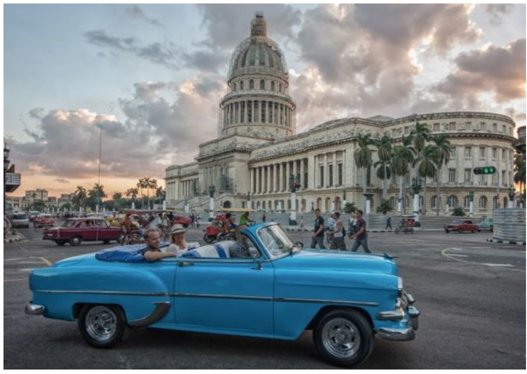
1953 Chevrolet Bel Air (3,600 lbs).

Given the foregoing it's difficult to see how replacing a half-billion fossil-fueled-powered cars with half-a-billion 1,200 pound heavier, somewhat less-polluting electric cars, is going to save the world. For what it's worth, here's my vote for THE WORLD'S MOST ECOLOGICAL CAR: