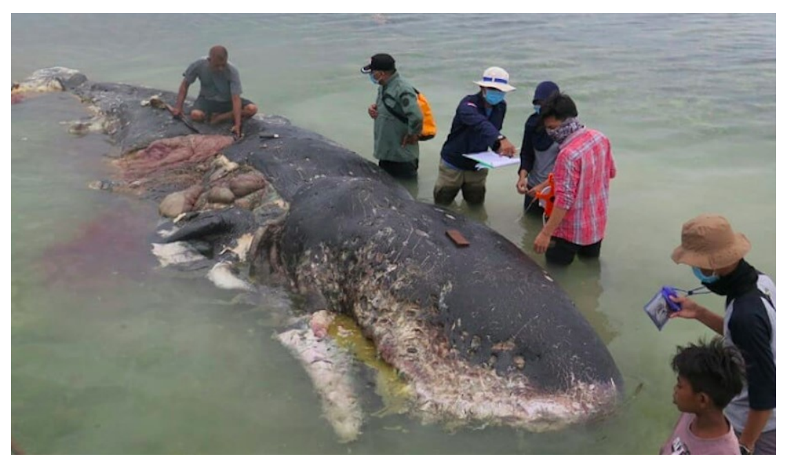
Sperm whale dies off Indonesia, November 21, 2018 from ingesting 13 pounds of plastic garbage including 115 plastic cups, a pair of flip-flops, 4 plastic bottles, 25 plastic bags, yards of plastic string etc. Another died off Thailand on June 3<sup>rd</sup> after swallowing 80 plastic bags. Still another died off Spain in April after ingesting 60 pounds of plastic trash, fish netting and garbage bags.<sup>37</sup> And those are just the ones that have been reported in one year. No one knows how many others died, or how many smaller creatures, dolphins, fish, sharks, sea birds, turtles and such perish every day from ingesting our trash, not to mention our toxic chemicals.

The EU has just approved a ban on single-use plastics, though this is subject to member approval so can't be assumed. Plus, inexcusably, this would not take effect till 2021 (sorry, whales and seabirds). British MPs have called for a ban on microplastics used in cosmetics. These are important steps but far from what we need to be doing right now. After all, we lived without all this disposable plastic junk in the 1940s and '50s and we weren't living in caves. We can have the "convenient" throwaway economy or we can have a habitable planet. We can't have both.