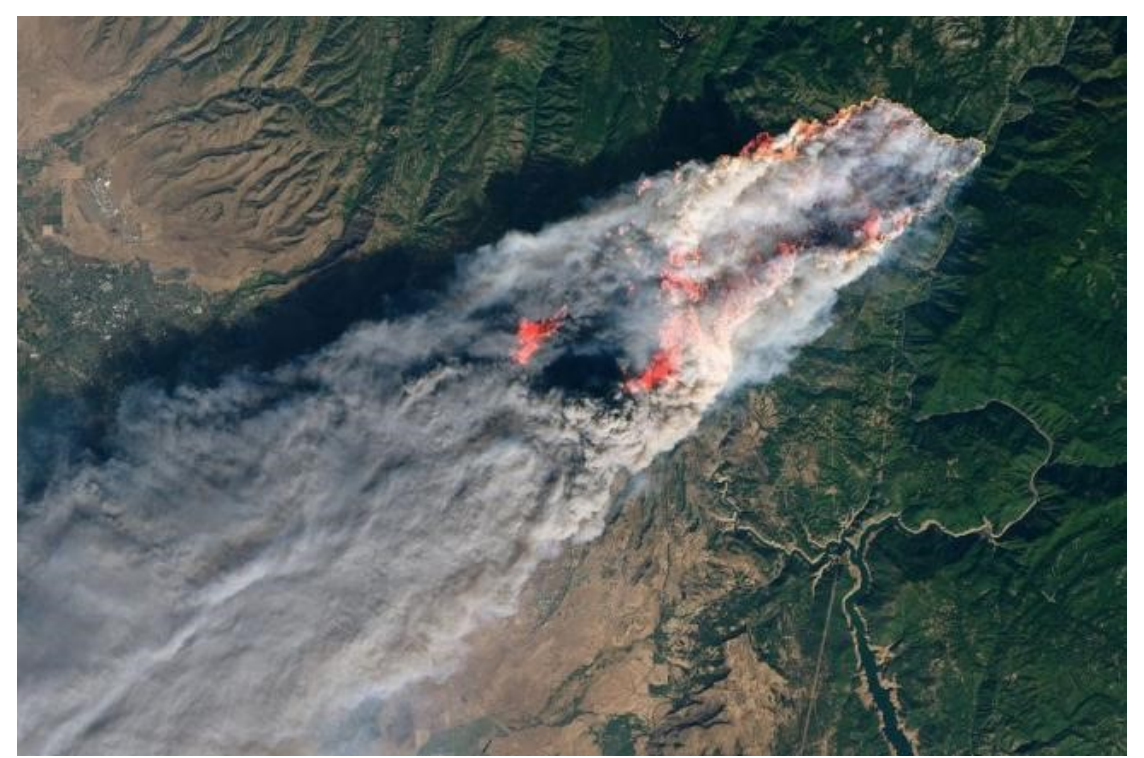
The wildfire that wiped out Paradise, California, viewed from space. The fire took 85 lives, 11 remain missing, and it destroyed 13,972 homes, 528 commercial buildings and 4,293 other structures.

Copyright: Richard Smith 2019 You may post comments on this paper at https://rwer.wordpress.com/comments-on-rwer-issue-no-87/