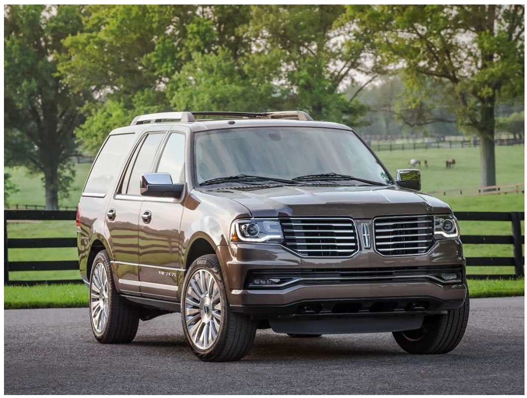
Lincoln Navigator: 6,609 lbs (also illegal to drive over the Brooklyn Bridge).