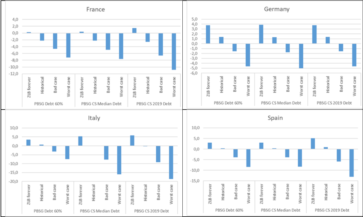
Figure 2. Fiscal space in the largest EA countries in 2019 (in percent of GDP)